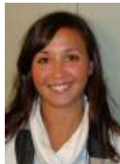
Jenn Peters Community Service Award