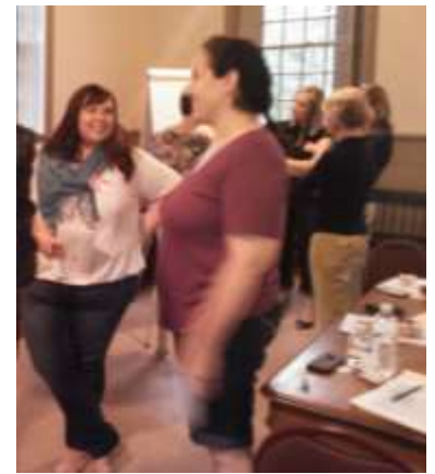
The 2014-2014 Leadership Team gathered for an evening training session at the PPS schoolhouse on June 10th.