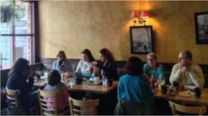
Guests fuel up at the Broadway Brunch before starting off on the Inn tour.